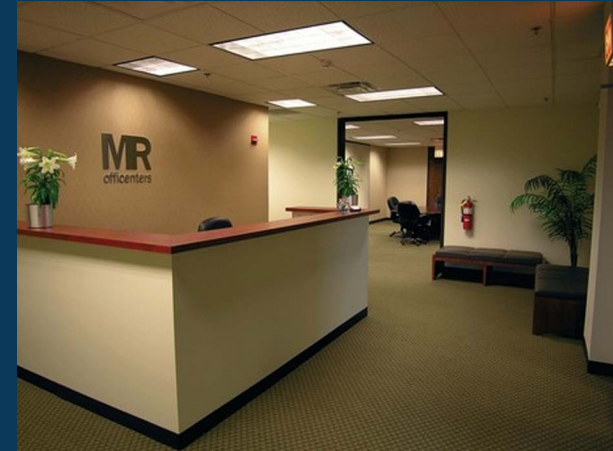
4749 Lincoln Mall Drive, Matteson, IL • 2nd floor